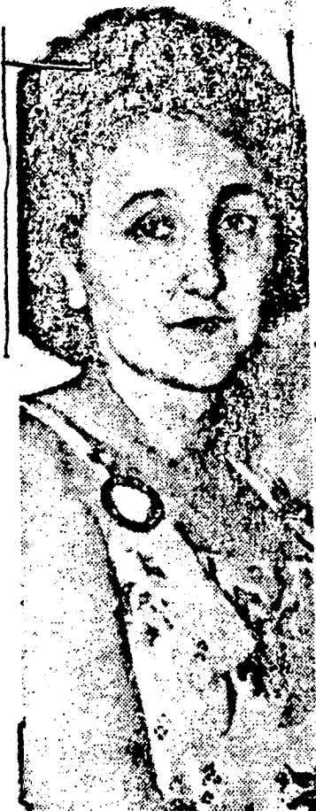
IN ICY CALM. convicted atom spy Ethel Rosenberg is awaiting electrocution at Sing Sing prison.